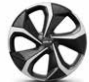
Alloy Wheel 255/45 R20